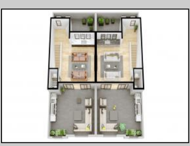
418-20 Farragut Wildwood Crest, NJ 08262