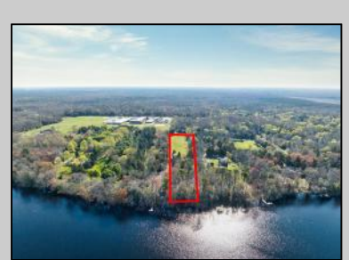
163 Fidler Dennisville, NJ 08270