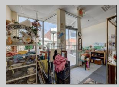
4501 Pacific Wildwood, NJ 08260