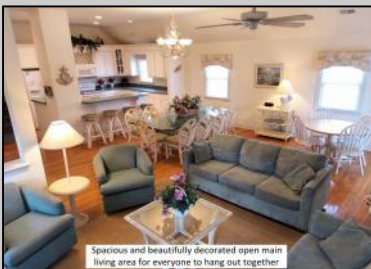
Spacious and beautifully decorated open main living area for everyone to hang out together